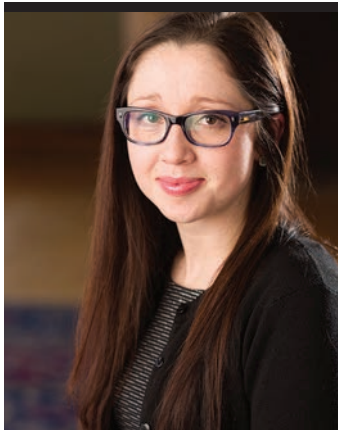
News from the Alumni Association President

Office of Alumni Relations MARYGROVE COLLEGE 8425 West McNichols Road Detroit, MI 48221-2599 Phone: (313) 927-1443 • Fax: (313) 927-1595 Email: jmachusak@marygrove.edu Website: alumni.marygrove.edu